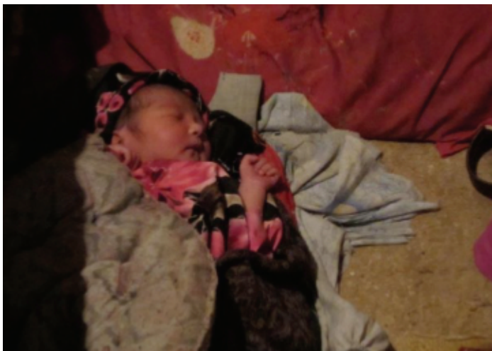
The newborn baby was found sleeping on the ground wrapped in a shawl.

On September 17 one of our staff members rushed into the house saying, "Mummy Mummy, come quickly. You must help!" She took me to a small room where there was a two-day-old baby and her mother on the floor,