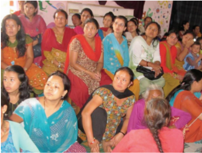
A rapt audience listens to a presentation on reproductive health at our recent health camp.

Twenty-nine women were given physical check-ups and not surprisingly, only two were in good health. We did our best, providing them with free medication.