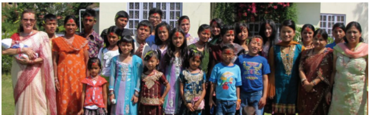
The most recent GSM family photo, taken during the festival of Dashain in September 2011.

I found out that the mother had given birth to the baby in an outdoor toilet and was overheard telling the other woman